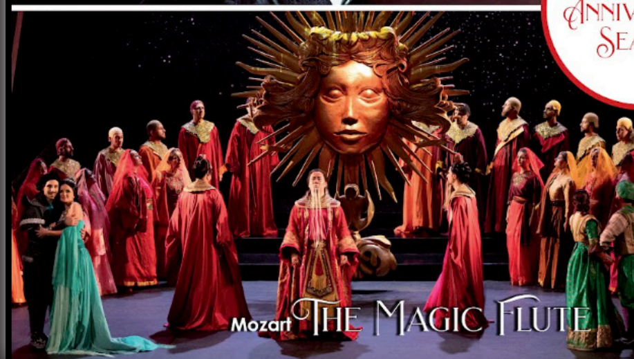
Mozart THE MAGIC FLUTE