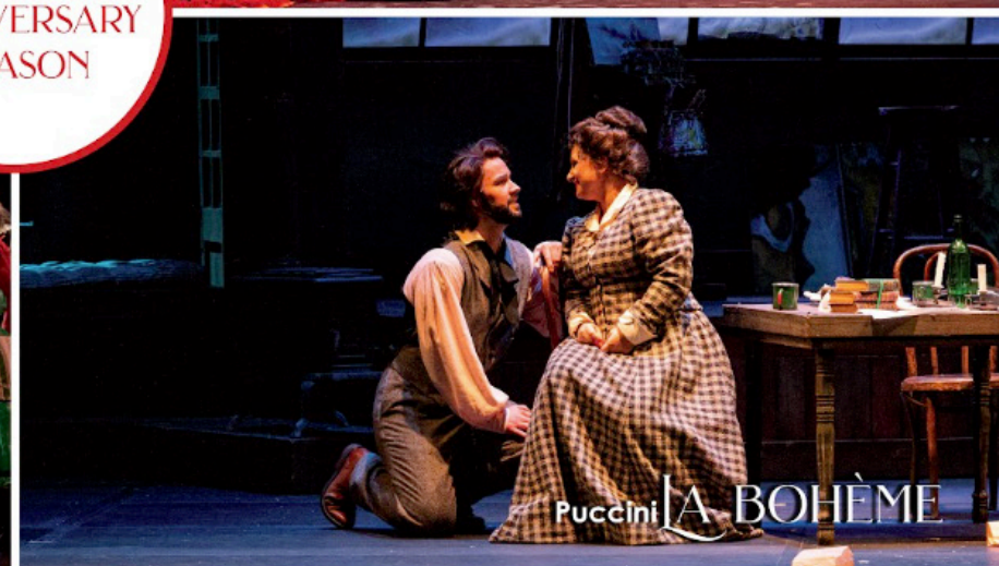
Puccini LA BOHÈME